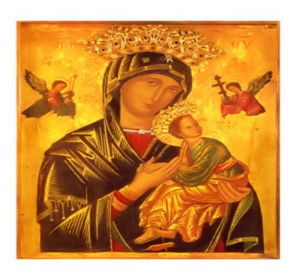
Mother of Perpetual Help Pray for Us