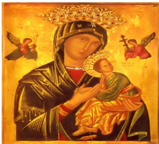
Mother of Perpetual Help Pray for Us