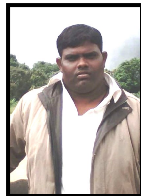
Rest in Peace